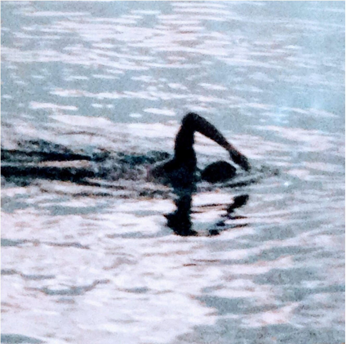
Crawl o stile libero: dal mito di Leandro a Tarzan.