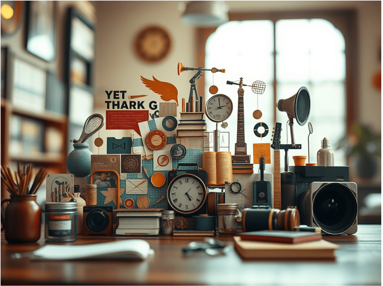
Immagine generata da Bing AI